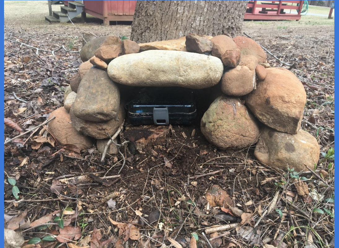
Info box is at Animal Tracker trailhead and at Sunspot.